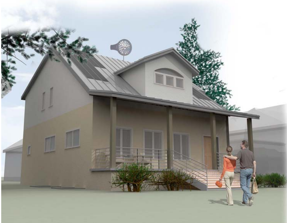
FIGURE 1. Final ZNETH design.